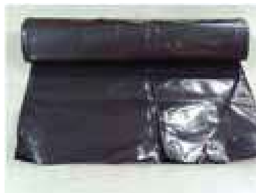
Waterproofing Membrane - SABS Hyperlastic orange 500 micron